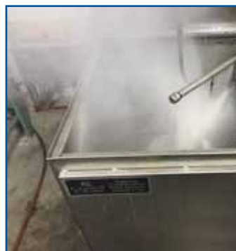
• Parts Washing