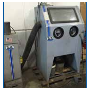
• Sand Blasting